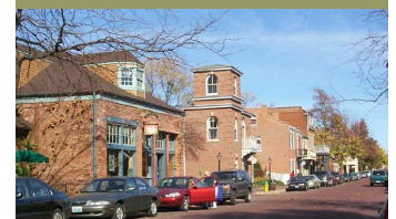
Main Street in historic St. Charles

On behalf of MOMATYC, I'd like to thank you in advance for your interest and participation.