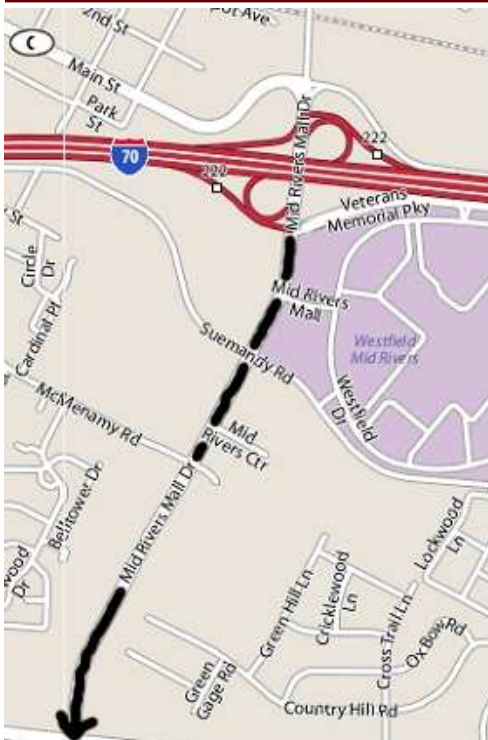
Map to SCC