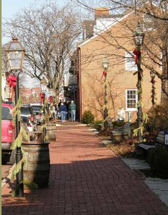
Looking down Main Street in historic St. Charles

All of us in the mathematics department at St Charles Community College (SCC) are excited about having you join us on our campus this spring for the 12th annual MOMATYC Conference!